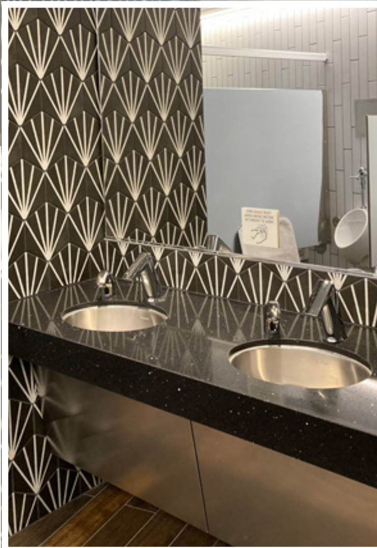
VIP Restrooms - Italian Quartz, Brilliante Nero