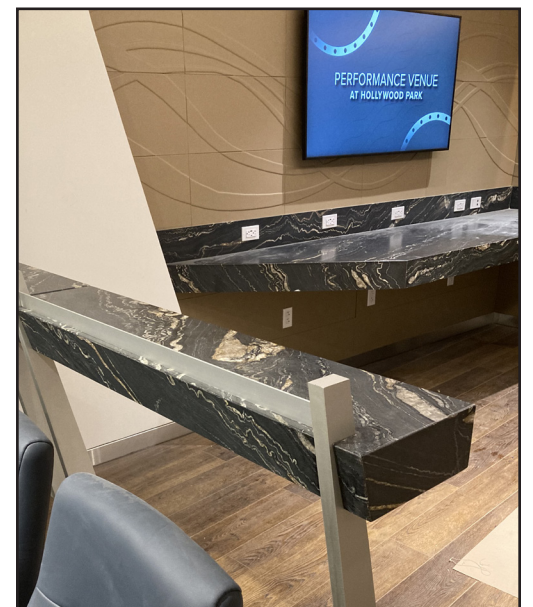
VIP Drink Rails - Italian Quartz, Tropic Brown