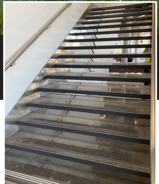
All Stair Treads - Italian Quartz, Acciaio

SoFi Stadium will host Super Bowl LVI in 2022, the 2023 College Football Playoff Championship Game, and will host the opening and closing ceremonies for the 2028 Summer Olympic Games. SoFi Stadium is also a leading contender to host World Cup matches in 2026.