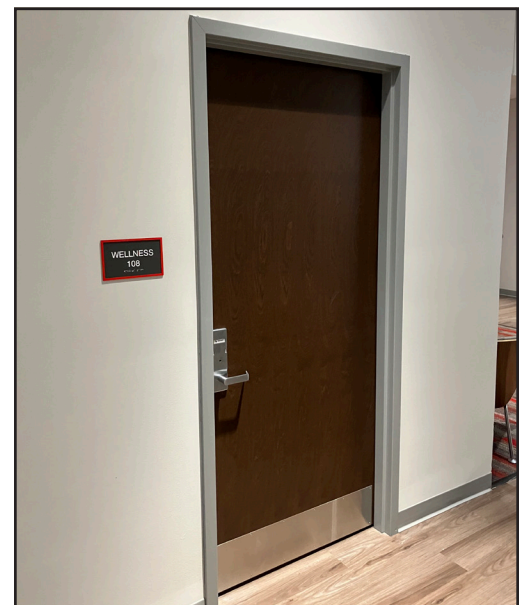
SCLC-5 - White Birch, Chocolate (CH 18) Finish