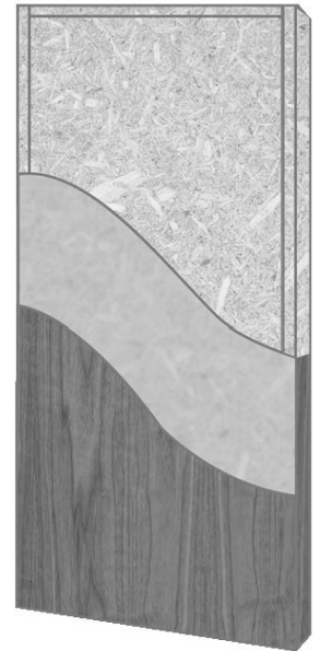
Palladium Fixed or Removable Edge