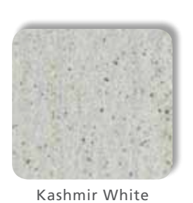
STANDARD - GROUP 3