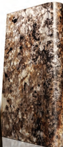
NOVA 180° Wrap Edge