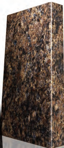
MARBELLA 1/8" Radius Edge