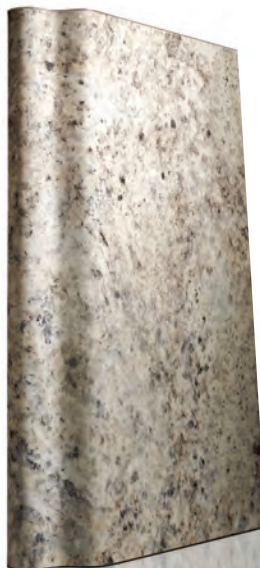
VALENCIA Full-Wrap Ogee