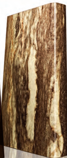
FUTURA Double-Radius Edge