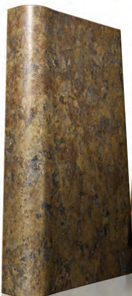
CAPRICE No Drip Edge