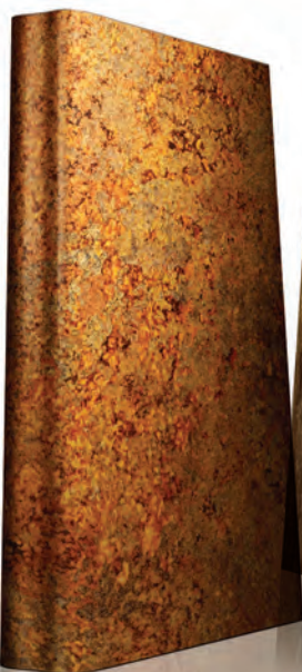
GENEVA Modern Drop Ogee