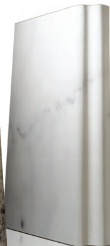
BARCELONA Contemporary Ogee