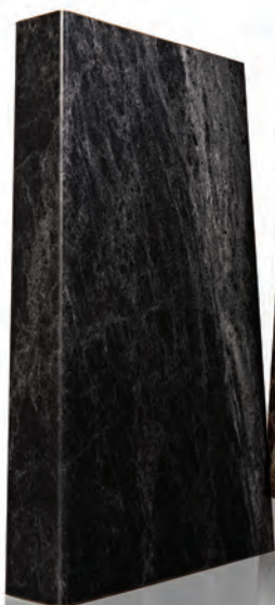
ORA 1/8" Radius Full-Wrap Edge