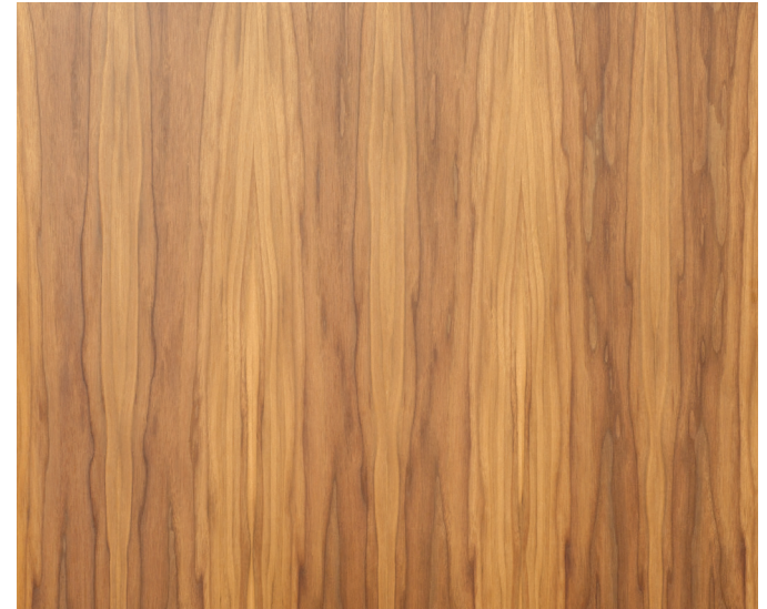
Wood veneer beauty inspired by heritage and updated with luxury performance