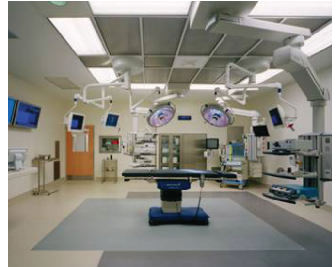
Durable, dependable performance for today—and tomorrow.