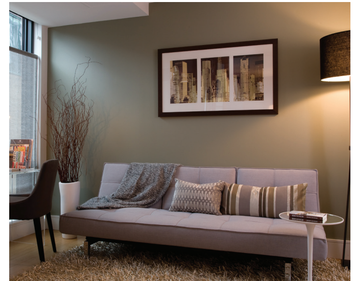
Distinctive design and well-appointed quality for luxury residences.